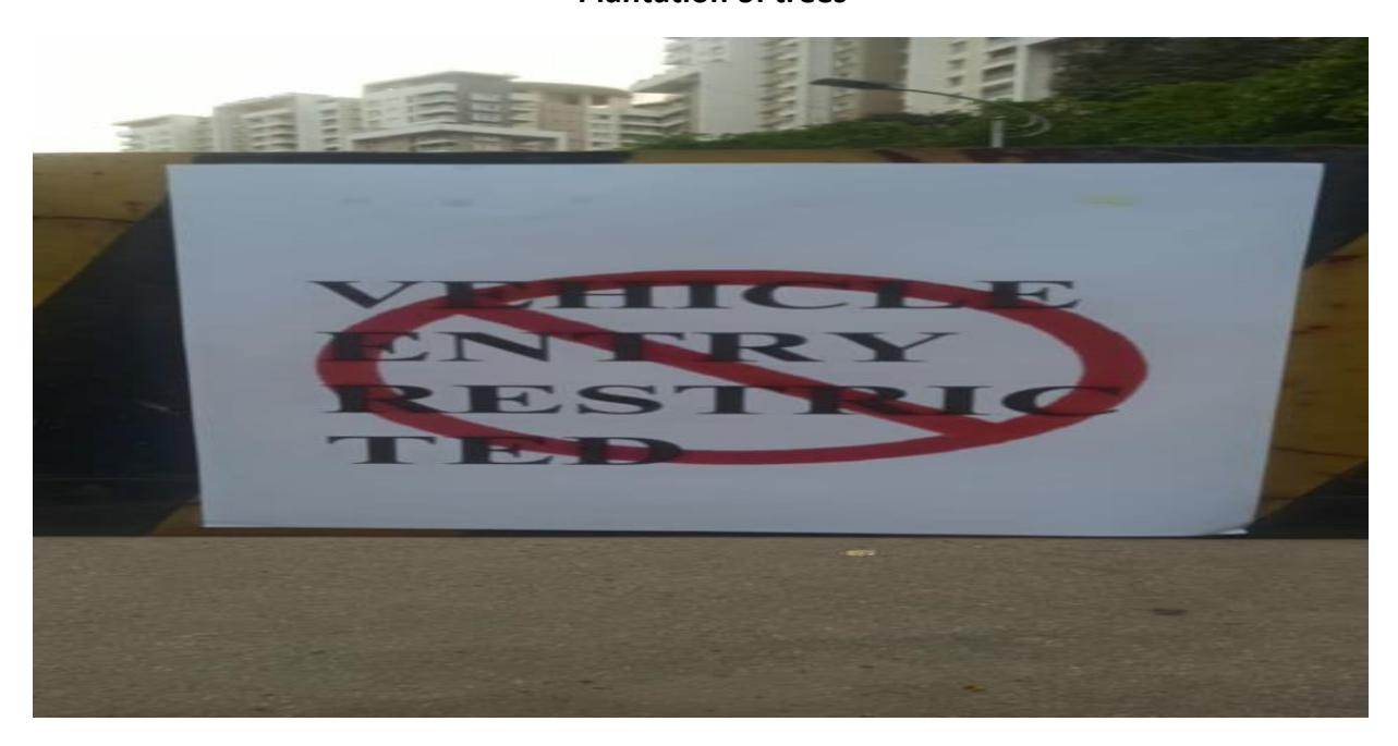
Restricted entry of vehicles