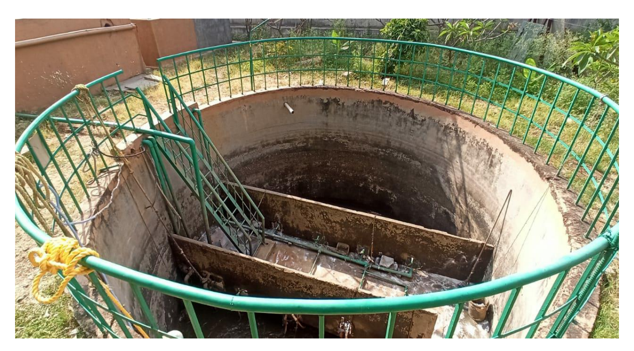
Recycling of waste water