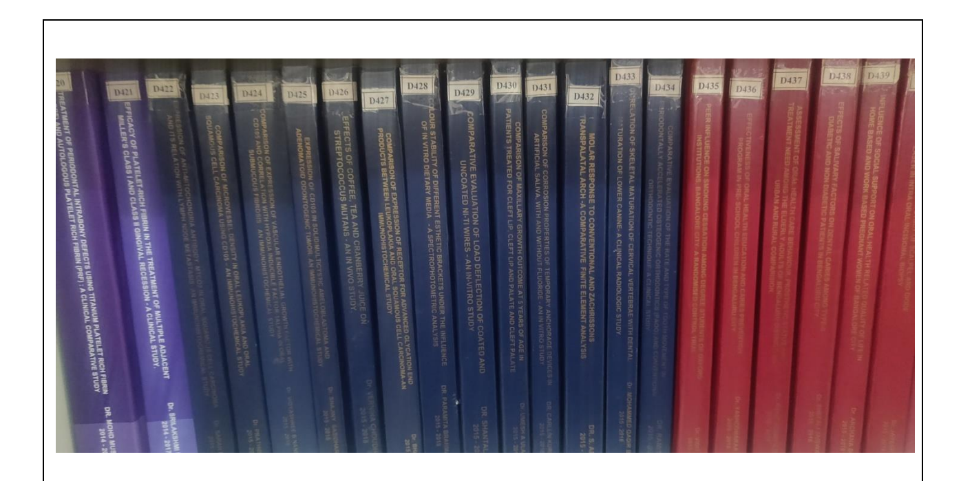
Synopsis By 1<sup>st</sup> Year Post Graduates