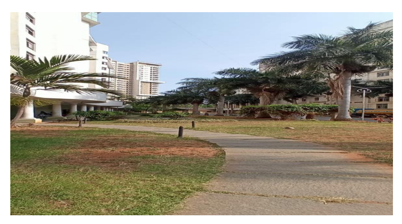
Plantation of trees