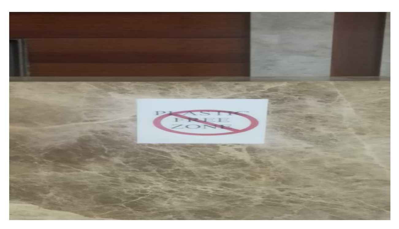
Ban of plastic in the campus