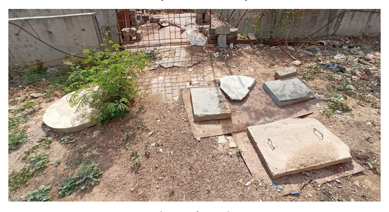
Rain water harvesting